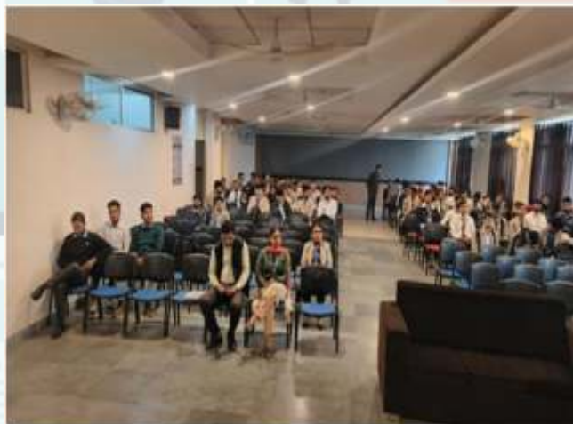
Attendees during the session