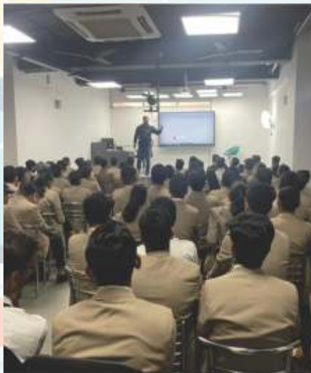
Attendees during the session