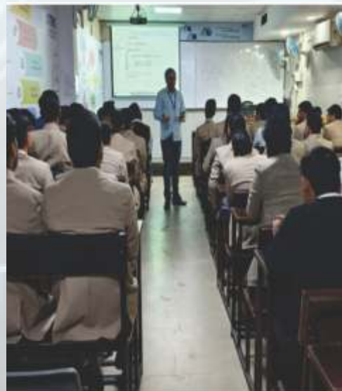
Expert delivering the session