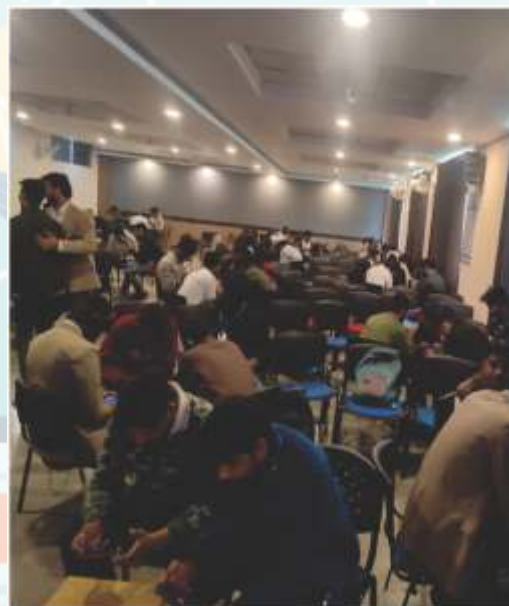
Participants during the activity