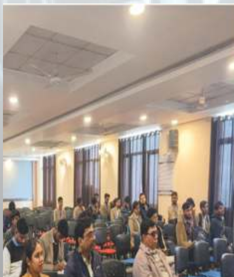
Attendees during the session