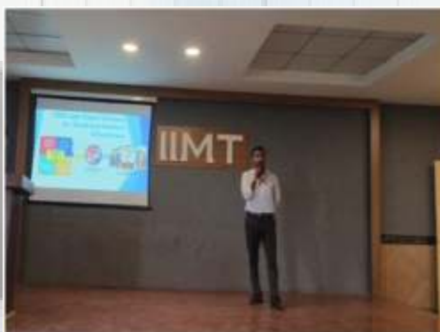
Students Participating in PPT Presentation Competition